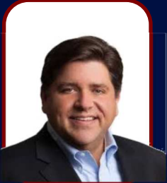
JB Pritzker Illinois Governor