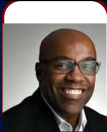
Kwame Raoul Illinois Attorney General